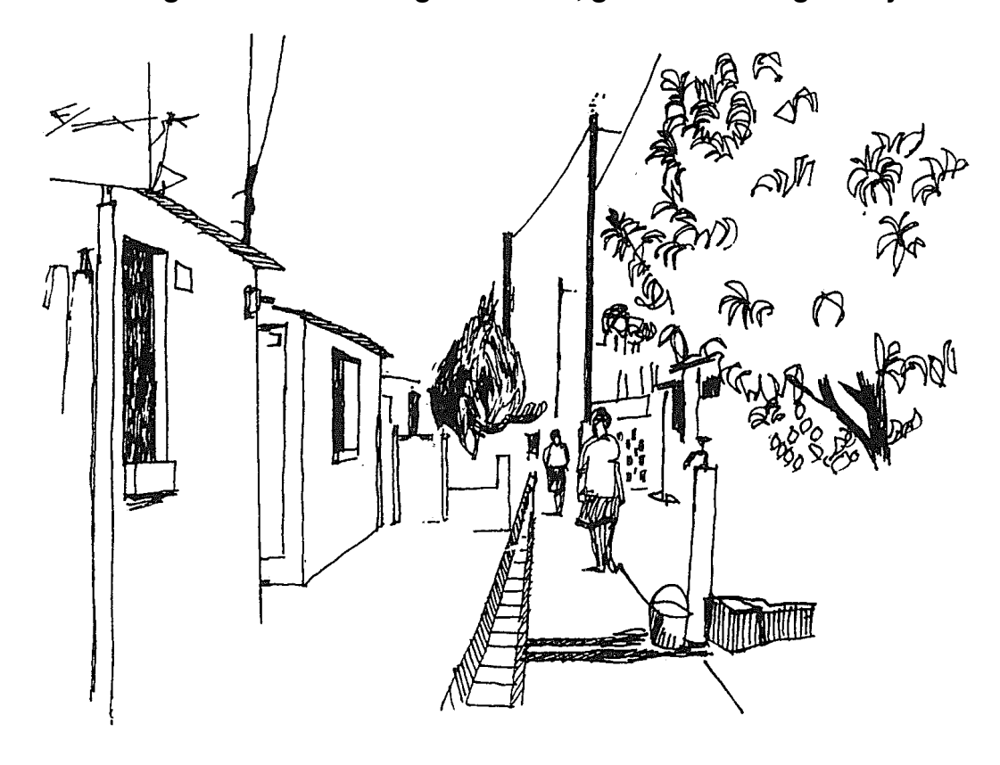
Figure 4. Transmission of water-washed disease is decreased if houses and surrounding areas are kept clean and if bodies, hair, clothing and bedding are washed frequently.