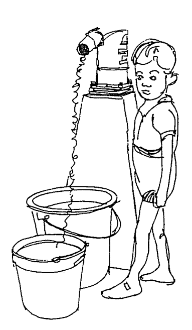
Figure 3: At least 30-40 litres of water per person per day is necessary for personal and domestic hygiene

Xerophthalamia (nutritional blindness), eye lesions that can result in blindness, is due to vitamin A deficiency, caused by a deficient diet or losses in repeated diarrhoeal attacks or severe illness. In Asia it affects over five million children annually, blinding 500,000; many die because of lowered resistance to other diseases. Sight is saved by early treatment with vitamin A in food (green leafy vegetables) or as supplements. Education on nutrition, therefore, is essential.